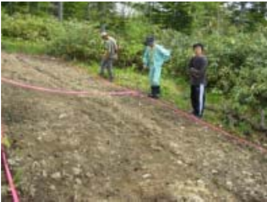
Nursery In forest on serpentine soil