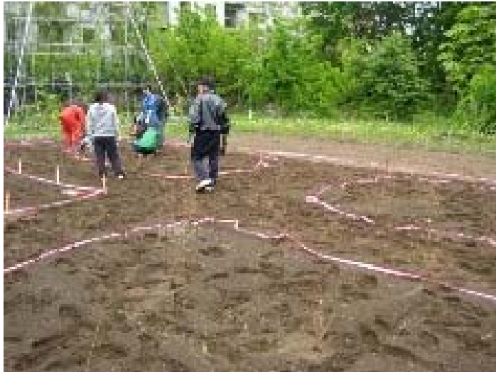
Estimation of Net Ecosystem Productivity with hybrid larch