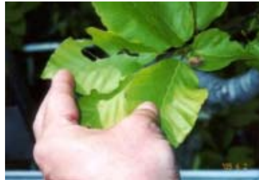
Analysis of Plant-Insect Interaction