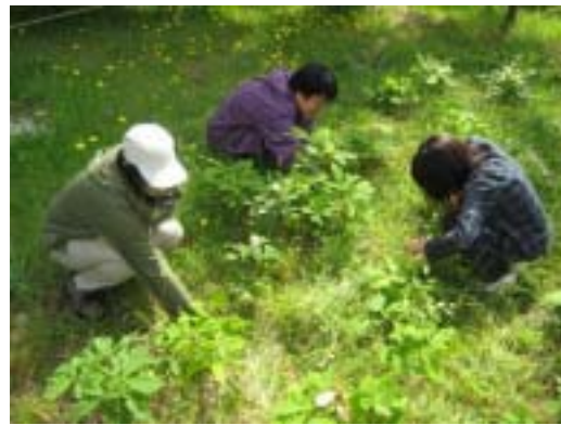
Carefully checking on trace of Insect grazing In Oak and Beech plantation