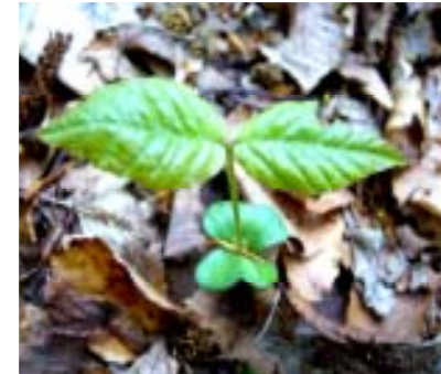
Current year seedling