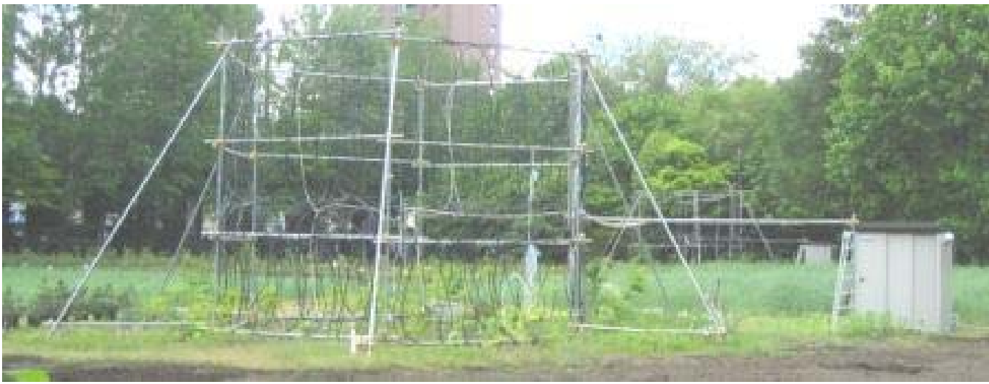
FACE (Free Air CO2 Enrichment) No. 1 and 2 in Sapporo