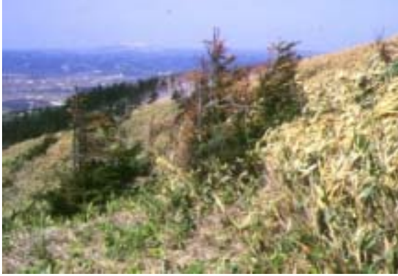
Degraded area with shallow snow depth