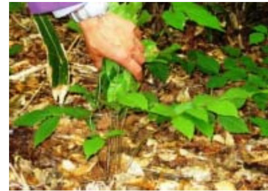
Regenerated beech seedlings by small mammals