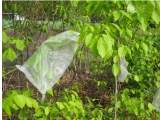
Experiment on induced defense In beech and oak