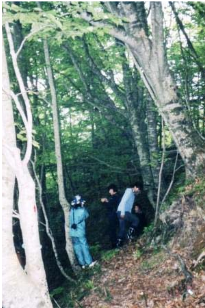
Observation of physiological ecology of regeneration of beech forest