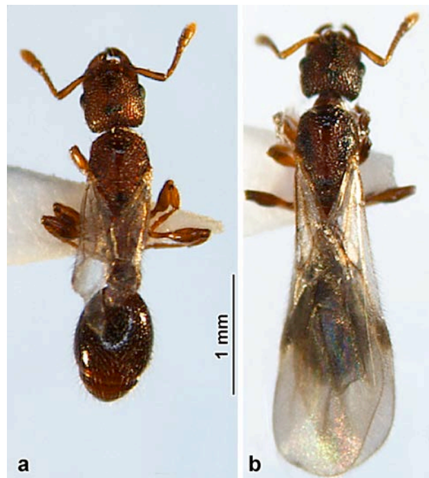
Fig. 1: Wing dimorphism in V. emeryi . (a) Short- and (b) long-winged queens produced from the same colony.

Conditions for inducing long-winged queens in the laboratory: Our field observations (see Results) showed that colonies containing more new reproductives produced more long-winged queens, suggesting that nutritionally rich colonies tend to produce long-winged queens in addition to short-winged queens. To determine the effect of nutritional factors on long-winged queen production, we recorded the number of new queens produced in laboratory colonies kept under different conditions, i.e., eight colonies fed once every two days and eight colonies fed once